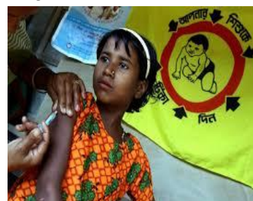
Table 2.1 shows the Number of children fully immunized or left out in Annex II.

According to the community 706 children have received full package of vaccines out of 721. This figure varies with the data provided by health sector which is 624 and received full doze of vaccine are 616 that means only 08 are out of vaccine received. Community think that every child is vaccinated may not be full doze however, there might be a few left out children which are not counted or recorded.