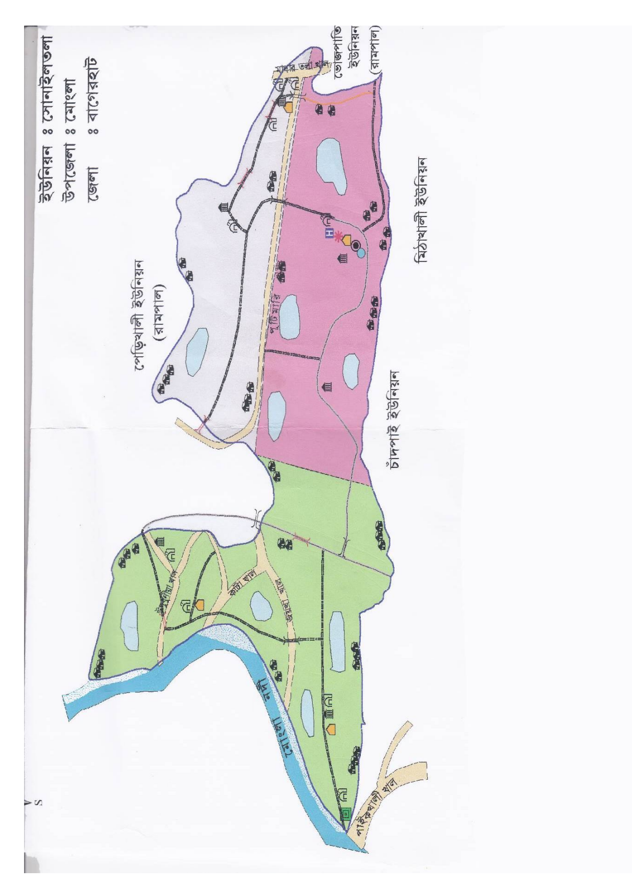
Map: Sonailtala Union of Mongla Upazila