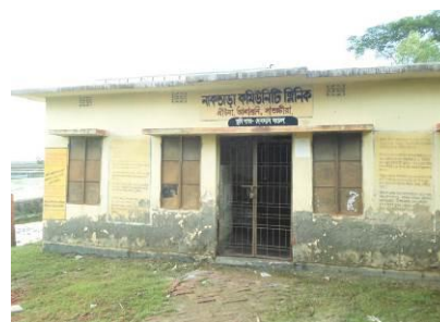
Table 2.3 in annex II shows the available facilities in the Union.

3.2 Facilities and services available in the Union: The Union has a Family Welfare Center (FWC), 3 functional Community Clinics (CC), 8 Satellite Clinics and 24 EPI sites. There are health services in the Union provided by NGOs which are mainly community awareness.