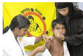
Table 2.1 shows the Number of children fully immunized or left out in Annex II.

According to the community 480 children have received full package of vaccines out of 538. This figure varies with the data provided by health sector which is 605 and received full doze of vaccine are 590 that means only 15 are out of vaccine received. Community think that every child is vaccinated may not be full doze however, there might be a few left out children which are not counted or recorded.